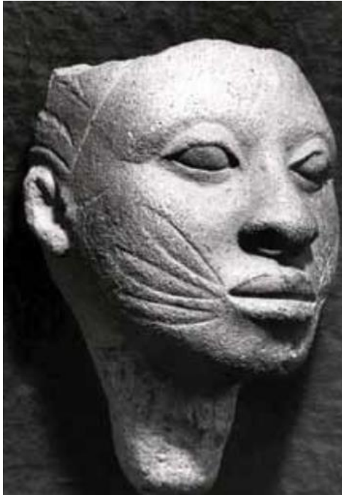
Fig. 1: Head with “cat whisker” Olokun Walode site, Ile-Ife, Nigeria, c. early 14th century CE. Terracotta; Height: 127 mm.