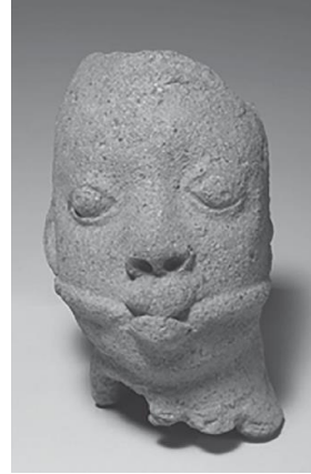
Fig. 7: Gagged head. Osángangan Qbámákin, Ifè.

Abiodun (1990) also points out the role of these heads in rituals. The sculptures are seen as “coming alive” (dahun) and “responding” (luti). This reinforces the belief that the sculptures are alive spiritually and underscores the notion that they interact with the believers. Supporting this assertion, Blier (2012) asserts that the heads of kings, queens, warriors, queens, priests, hunters, court servants, and others became supernaturals who are part of rituals today. The figures are identified with “powerful” individuals from Ife’s distant past who were subsequently deified, among them Oramfe (the thunder god), Obatala (god of the autochthonous residents), Oluorogbo (the early messenger deity), Obalufon (King Obalufon II), Oranmiyan (Obalufon’s adversary, the military conqueror), Obameri (an ancient warrior associated with