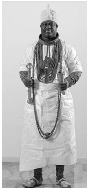
Fig. 4: Picture of Ooni Adeyeye Enitan Ogunwusi.