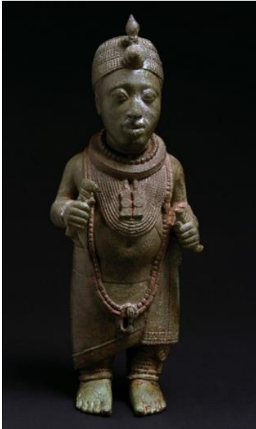
Fig. 3: Figure of Ooni of Ife. Source: Star (2011)

crown during the Olójó festival and other important traditional rituals and festivals. Thus, the “figure of Ooni” depicted in the Ife copper alloy figures does not represent the cone-shaped Aare crown. Rather, Abiodun (1994) affirms that the sculptures are representations of Ifá priests. In recent times, Ooni’s dress (in Figure 3) also looks very similar to the copper alloy figure (in Figure 4). This representation of the Ooni might have been influenced by the narrative popularised by many scholars of Ife art. This may also be due to the westernisation of African art history. However, according to Abiodun (2014), in the ancient traditional Yoruba tradition, it is a taboo and abomination for an artist to depict the naturalist form of the Ooni.