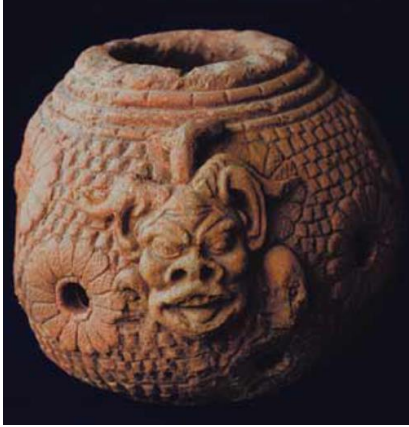
Fig. 6: Vessel with monstrous face and sixteen rosette Patterns around the surface, some with mica centers Aroye compound, Ile-Ife. Nigeria, c. early 14th century CE.

“like an imole, no one can look at their eyes. (Blier, 2012).