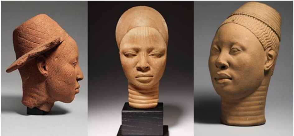
Fig. 5: Terracotta heads from Ife dated between 12th and 15th century; heads of Ife dignitaries.

(Blier 1985), another political undertone of the Ife head is revealed in the discovery of a terracotta head recognised as the “Lajuwa” by the Late Ooni Adesoji Aderemi. The head is associated with servants or Osi-efa , who serve as surrogates representing the kings by wearing their paraphernalia. Lajuwa (figure 5) is seen as a messenger, representative or advisor of the Oni. This discovery reveals a political dimension of how the Oni is sometimes replaced by these surrogates when he is indisposed or unavailable. Ife art and terracotta heads connect with Yoruba cosmology, mythology and ritual practises.